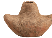
Bird-shaped Pottery Masan-ri Pyosan site in Hampyeong Three Kingdoms period