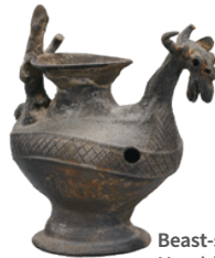
Beast-shaped Pottery Manuichong Tomb 1 in Haenam Three Kingdoms period