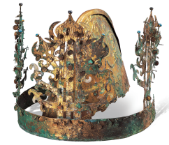
Gilt-bronze Crown National Treasure | Sinchon-ri Tomb 9 in Naju Three Kingdoms period

The Jar Coffins Room exhibits around eighty large jar coffins that show the development of jar coffins by period, and also screens a media artwork on the theme of "Eternal rest" on the wall. The Ancient Tomb Artifact Room exhibits diverse artifacts excavated from ancient tombs, including ironware, beads, earthenware, and other burial accessories, and also introduces the cultural exchanges that took place with other countries through those burial accessories.