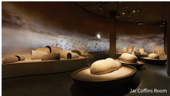
Jar Coffins Room

The Prehistory and Ancient History Room introduces the local culture from the Old Stone Age to the Bronze Age, the entrance into ancient society, and the development of ancient society. The Medieval and Early Modern History Room introduces social and cultural aspects of the Unified Silla period and the Goryeo Dynasty, which developed by exploiting the waterways of the Southwest Sea area of Korea. It also provides information about the ideas and rituals, Buddhist culture, and living culture of the Goryeo and Joseon periods.