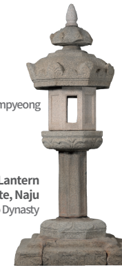
Stone Lantern Inside the West Gate, Naju Treasure | 1096, Goryeo Dynasty