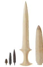
Polished Stone Daggers · Arrowheads Deoklim-ri Baekyang Dolmens in Hampyeong Bronze age