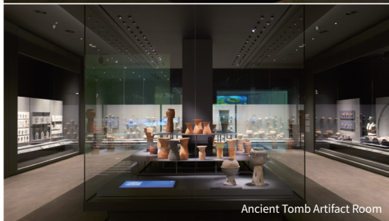
Ancient Tomb Artifact Room