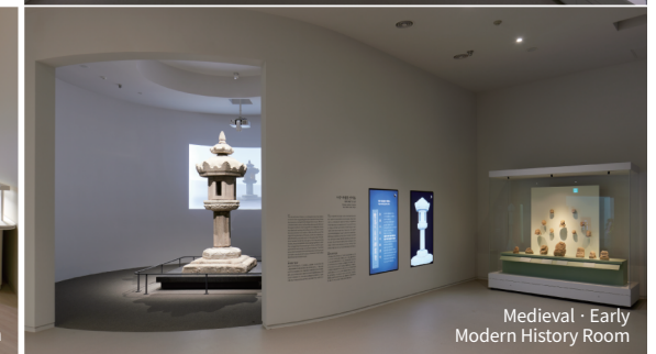
Medieval · Early Modern History Room