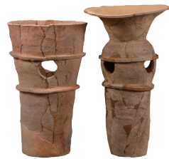
Cylinder-shaped Potteries Wolgye-dong Tomb 1 in Gwangju Three Kingdoms period